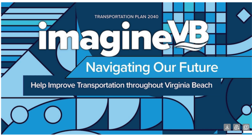
Provide Input on the Future of Transportation in Virginia Beach Survey is online at SpeakUpVB.com , Jan. 16 – March 8.

Virginia Beach residents can assist City leaders in determining future transportation plans by completing a five-minute, 19-question survey online at SpeakUpVB.com/TransportationPlan through March 8, 2024.