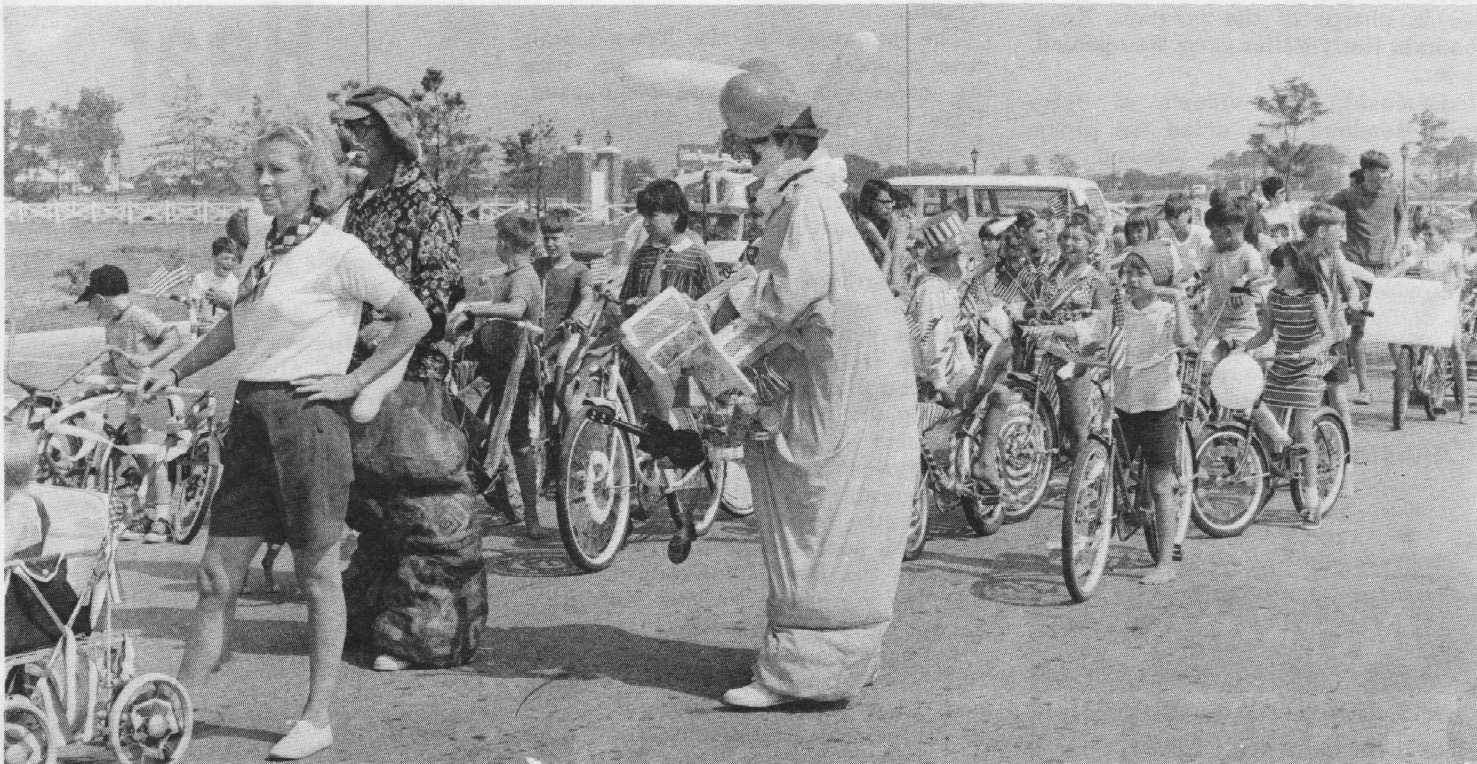
Lining up for Pembroke Meadows parade

The fun-filled day ended with a family style picnic, dancing and a sing-along. Pembroke Meadows will long remember July 4, 1969