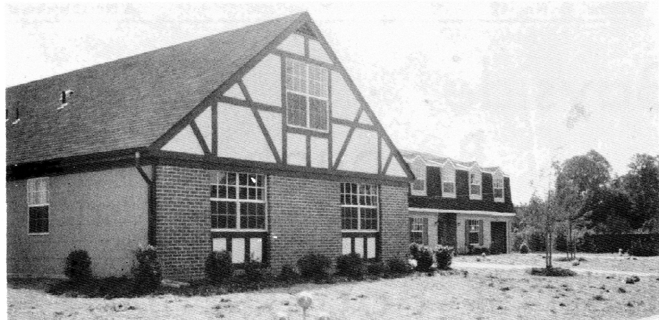
The "Fairfax" and "Chesterfield" in Dunedin.

Terry Corp. is expanding operations from the City of Virginia Beach for the first time since it has been building homes in Virginia.