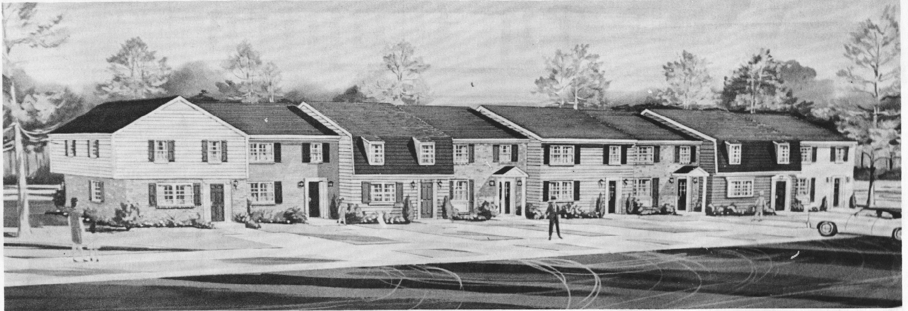
Artist's Conception of Pembroke Park Townhouses