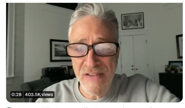
Q 2 t↓ 4 ♡ 5 ılıı 1

Jon Stewart ② @jonstewart · Dec 12, 2022 Attention all Veterans!!!!