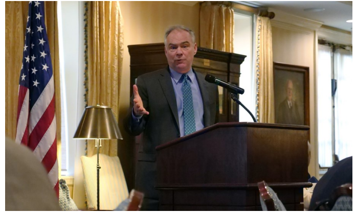
Senator Kaine addresses luncheon, discusses his proposal of the Military Spouse Employment Act of 2018, designed to provide military spouses an advantage in federal hiring

Well attended, Congressional members present at the luncheon included Senator Tim Kaine (D-VA), Congressmen Rob Wittman (R-1), Scott Taylor (R-2), Bobby Scott (D-3), Tom Garrett (R-5), Dave Brat (R-7), Don Beyer (D-8), Barbara Comstock (R-10), and Bob Goodlatte (R-6). All of the members emphasized the need for a strong Defense, thanking MOAA National and all chapters nationwide for an eternal vigilance and unending reminder for such need.