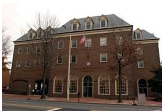
MOAA Headquarters Building Alexandria, now under renovation