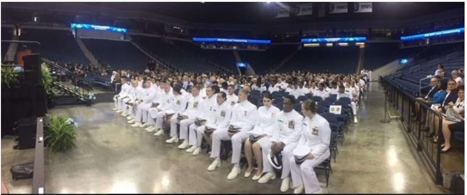
Panoramic photograph of Joint Commission Class 2018. on May 4, 2018 at the Ted Constant Convocation Center, Old Dominion University