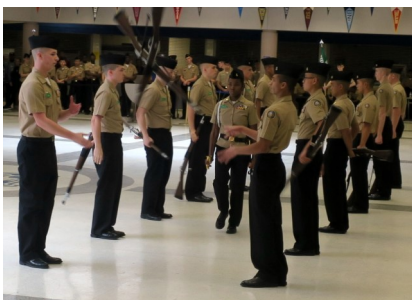
Green Run High School NJROTC Trick Drill Team

On February 10, Princess Anne High School hosted an outstanding NJROTC drill competition for many of the local NJROTC units. The units competed in six different events throughout the competition. Congratulations to winner Green Run High School, along with Norview High School in second place, and Salem High School taking home third place.