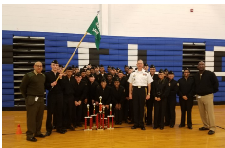
Green Run High School NJROTC 1st Place Winner