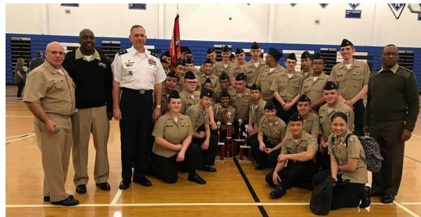
Salem High School NJROTC 3rd Place Winner